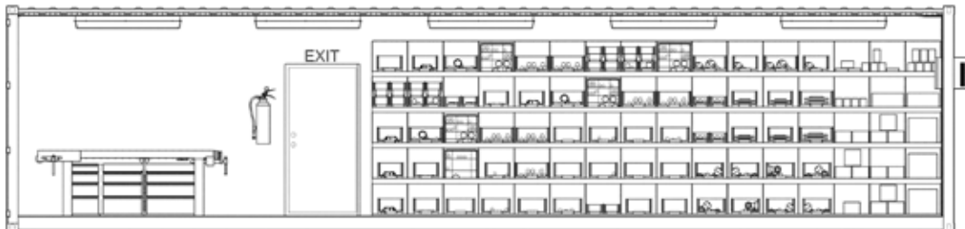
Interior wall with workbench, shelving, and side door

The container's design may be modified from the above design to meet specific customer needs. These modifications may include CAT5 cable for internet connectivity, custom shelving or storage, a desk, or other customizations.