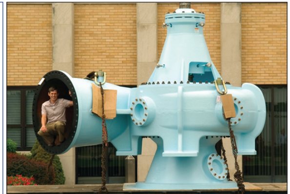
WASTEWATER PLANT PRODUCTS