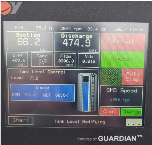
Current status is displayed on the NOV VFD screen through the Guardian™ software.