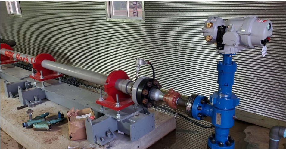
This HPS at the customer's SWD facility is equipped with an automated choke, controlled by the NOV variable frequency drive (VFD).