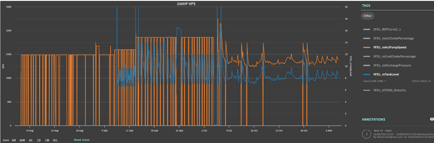
This chart shows the history of pump starts and stops for the customer's HPS. In this case study, automation using the Guardian™ software begins just over halfway through the measured period, resulting in a greatly reduced number of pump starts and stops.