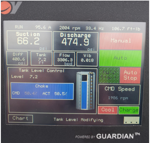
Current status is displayed on the NOV VFD screen through the Guardian™ software.