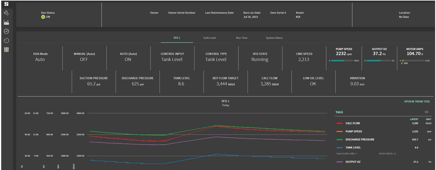
Current operating conditions are displayed in a dashboard view, showing flow, pump speed, discharge pressure, tank level, output and more.